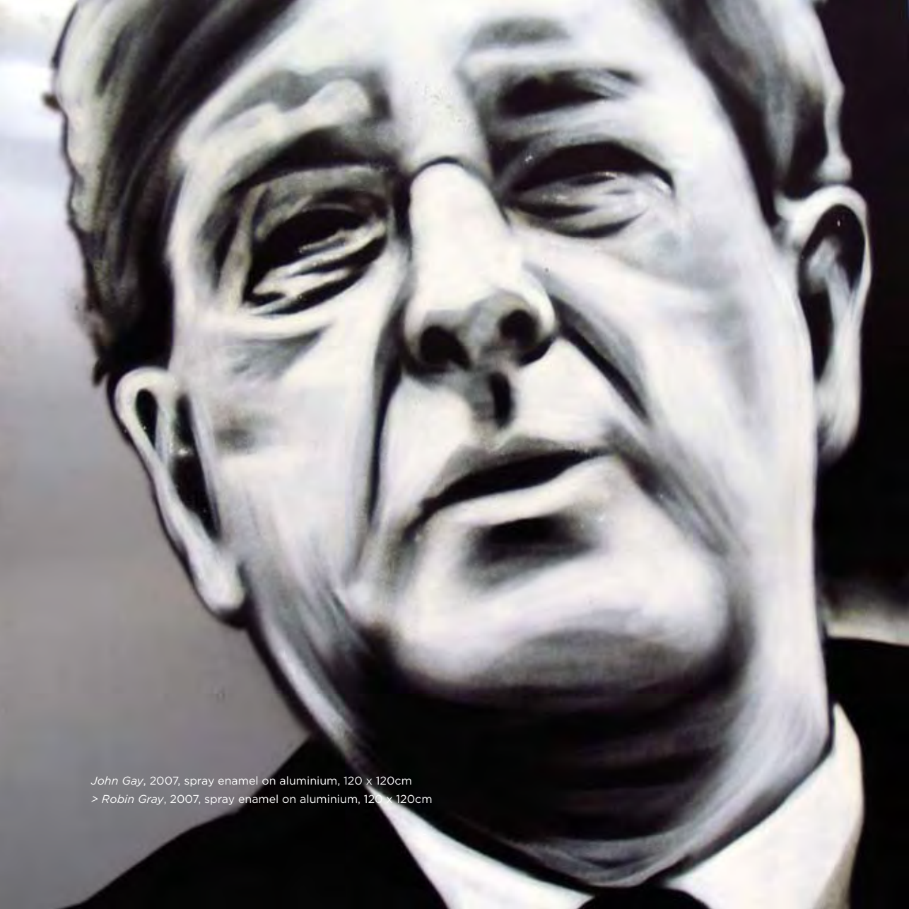
John Gay , 2007, spray enamel on aluminium, 120 x 120cm

> Robin Gray , 2007, spray enamel on aluminium, 120 x 120cm