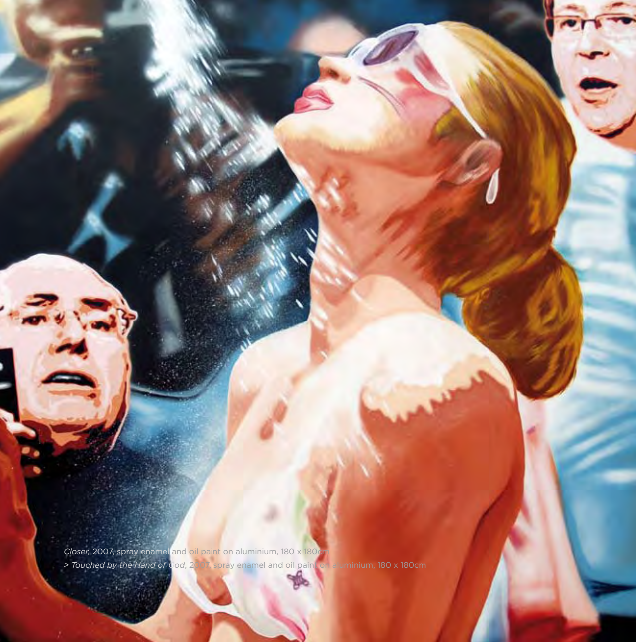
Closer , 2007, spray enamel and oil paint on aluminium, 180 x 180cm

> Touched by the Hand of God , 2007, spray enamel and oil paint on aluminium, 180 x 180cm