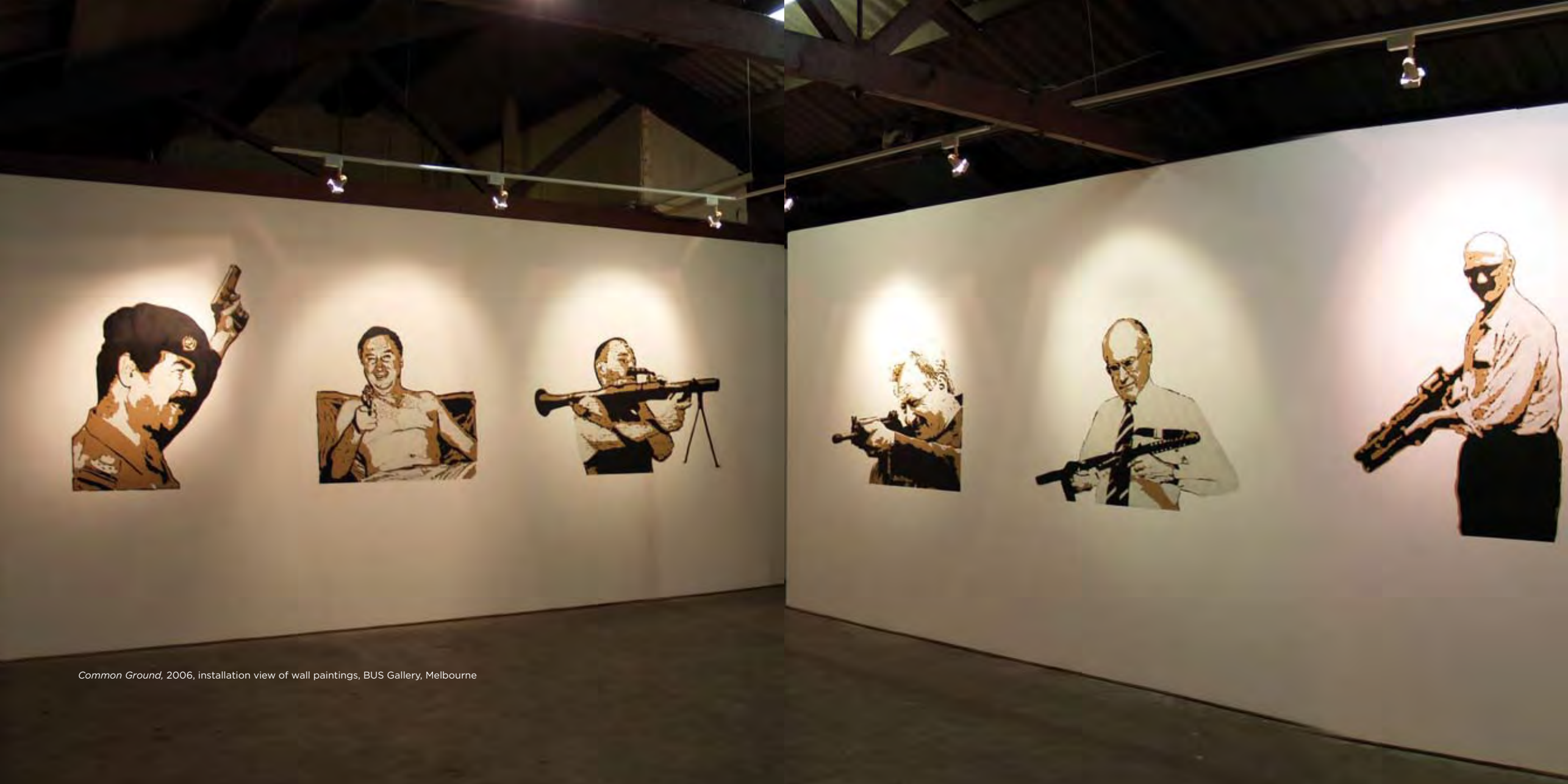
Common Ground , 2006, installation view of wall paintings, BUS Gallery, Melbourne