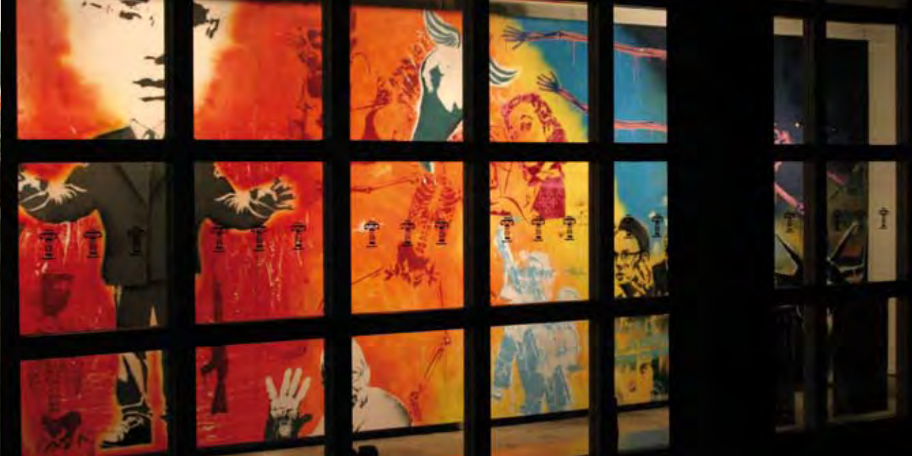
Dissent Disrupt Desert , 2004, Die Laughing Collective (Jamin, Paicey & Empire) spray enamel and household paints on MDF, 240 x 1200cm Installation views from opening night with Hobart band The Scandal performing in space