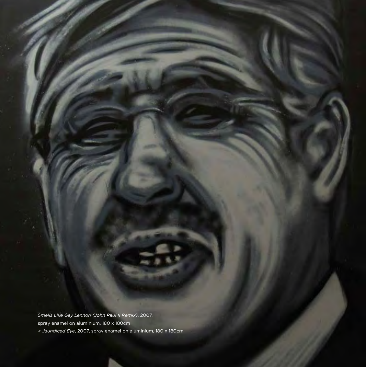
Smells Like Gay Lennon (John Paul II Remix) , 2007, spray enamel on aluminium, 180 x 180cm > Jaundiced Eye , 2007, spray enamel on aluminium, 180 x 180cm