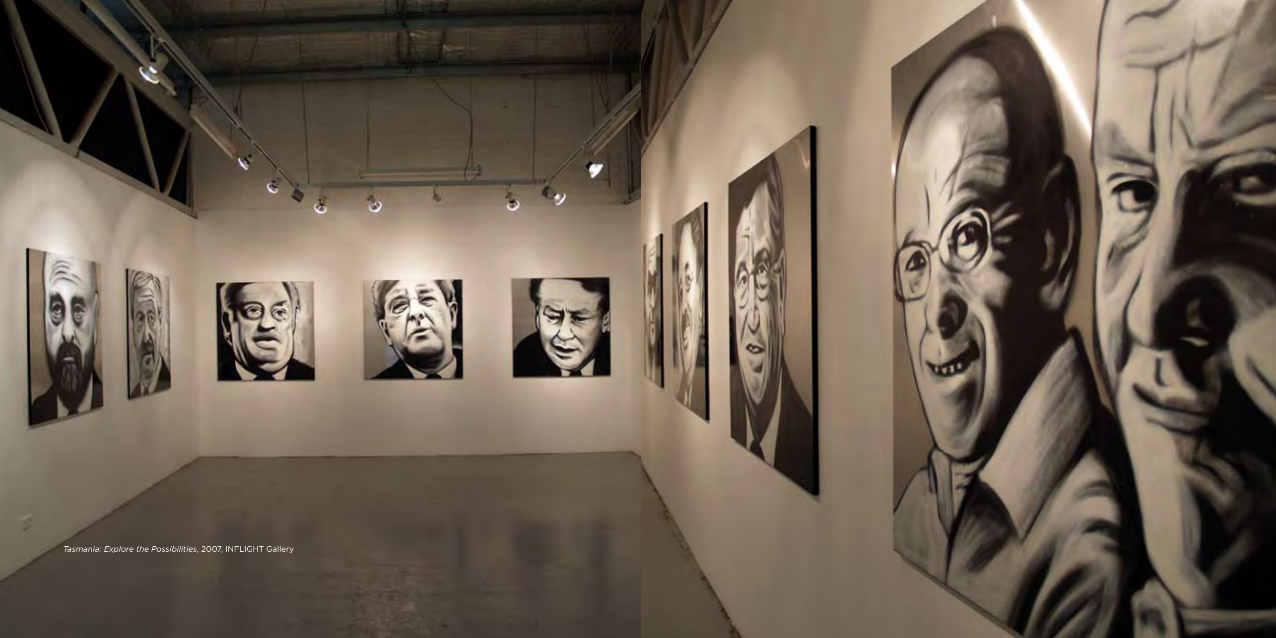
Tasmania: Explore the Possibilities, 2007, INFLIGHT Gallery