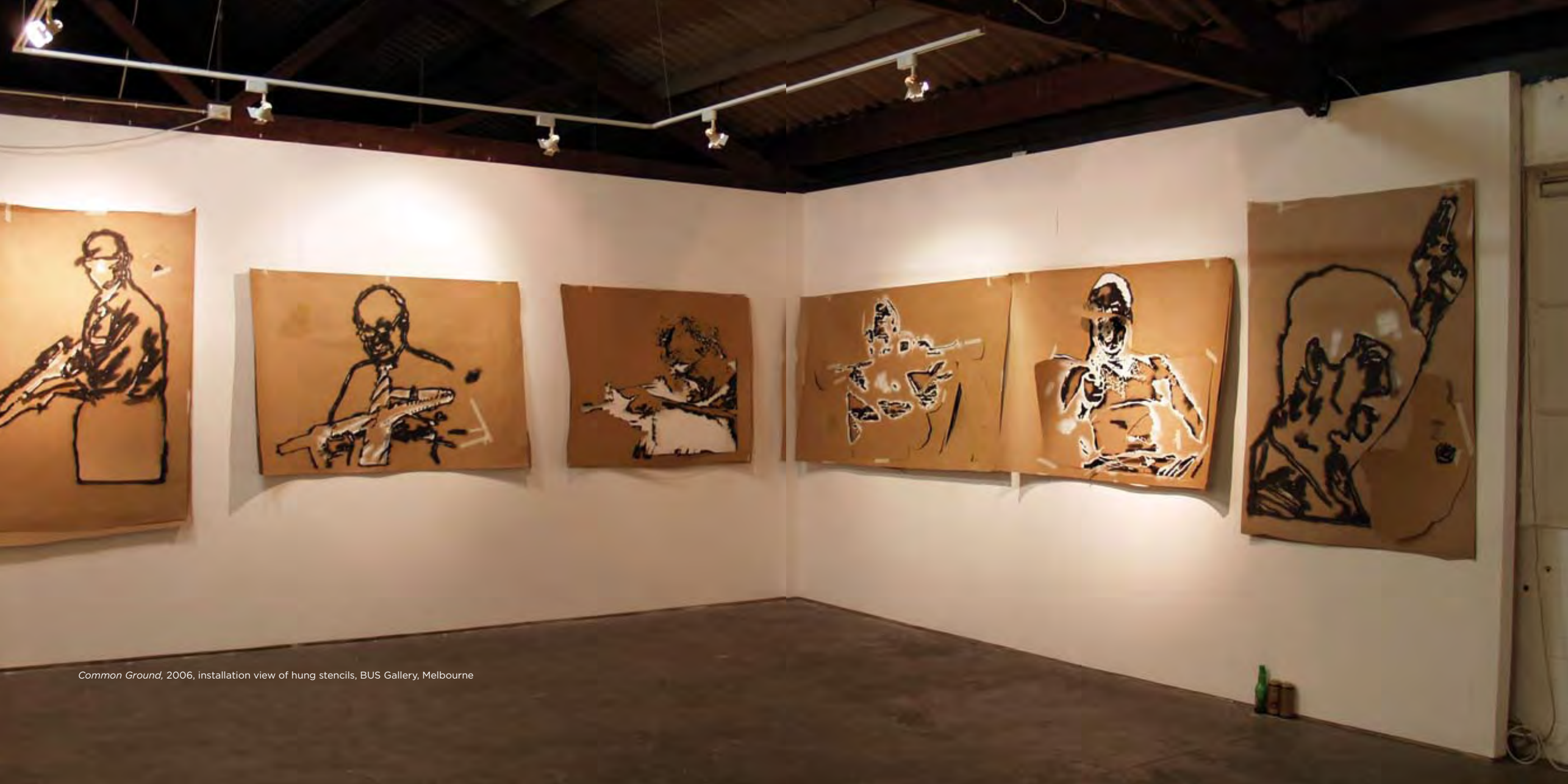
Common Ground , 2006, installation view of hung stencils, BUS Gallery, Melbourne