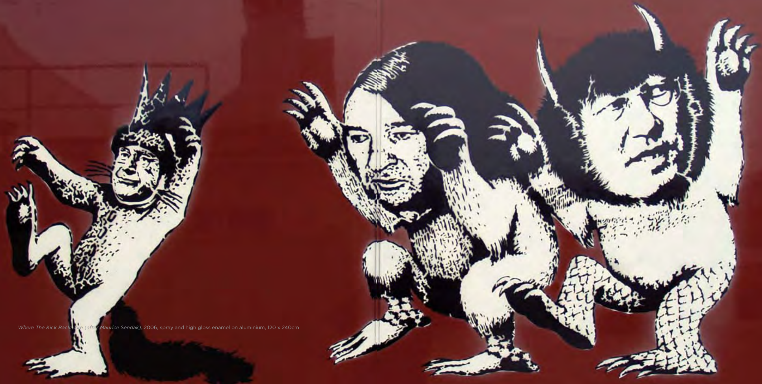
Where The Kick Backs Are (after Maurice Sendak), 2006, spray and high gloss enamel on aluminium, 120 x 240cm