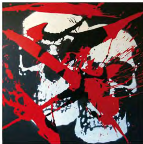
Sedition , 2005, synthetic polymer and spray & high gloss enamel paint on MDF, 6 components: 240 x 360cm (overall)